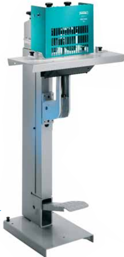
NAGEL MULTINAK FS with treadle.

The preformed staples ensure accurate production of booklets and pads from just 2 up to 270 sheets. For brochures or booklets to be filed in ring binders without being punched the original Nagel loop staples are the perfect solution.