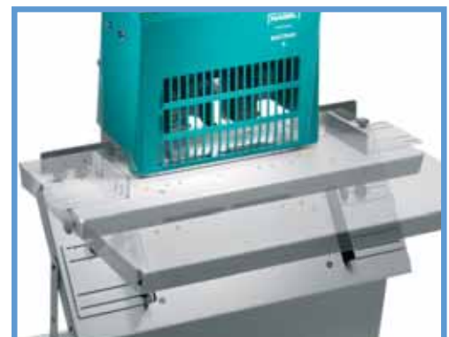
Option for large formats: the NAGEL MULTINAK table extension.