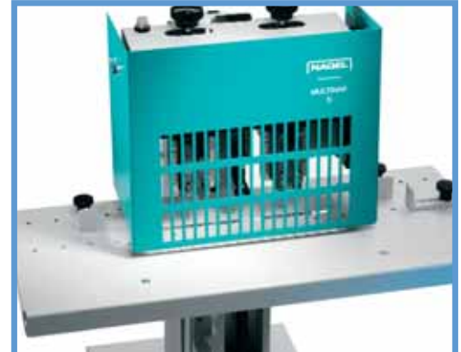
Easy transition from flat to saddle stapling.

■ The change-over from flat to saddle stapling is made by simply flicking over the table. The optional table extension includes a back stop bar and makes it easy to handle large formats like calenders and DIN A3 size. Special clamps for small formats to centre and hold down the brochure come as standard.