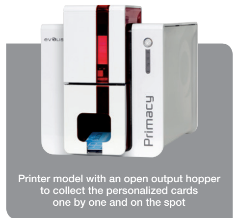
Printer model with an open output hopper to collect the personalized cards one by one and on the spot